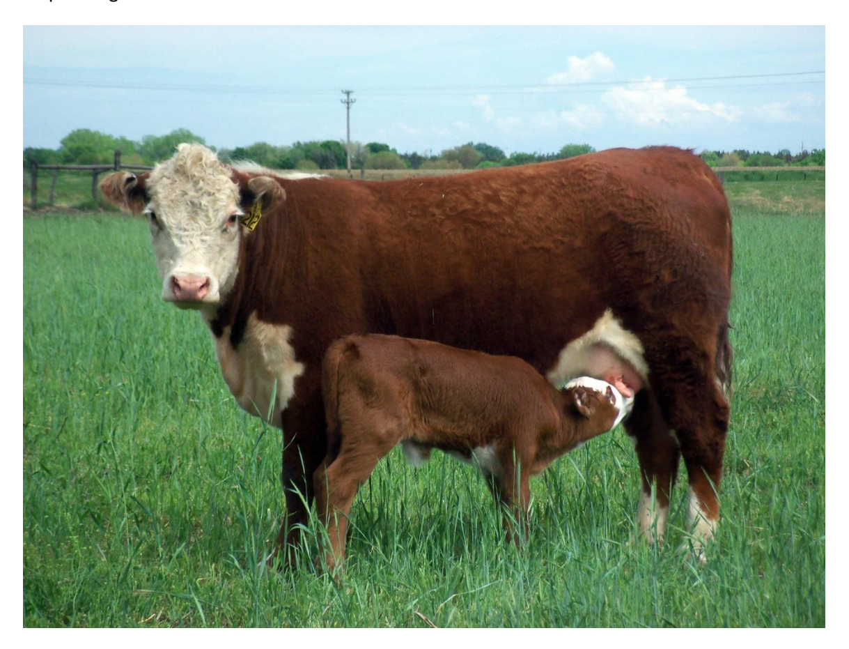
A baby calf is born and nurses from its mother.