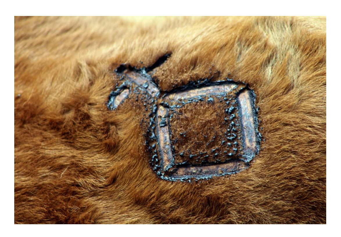
Calves are branded and weaned from their mother.