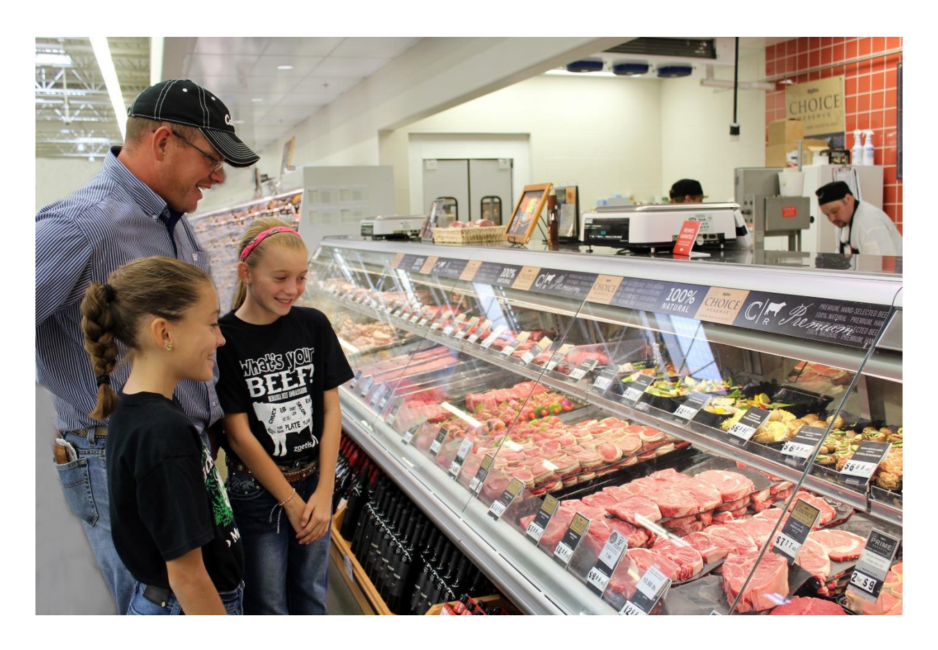
Cut and packaged meat is sold to consumers.