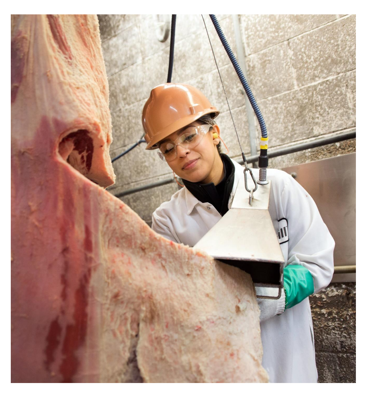
Cattle arrive at a beef processing facility and their meat is inspected.