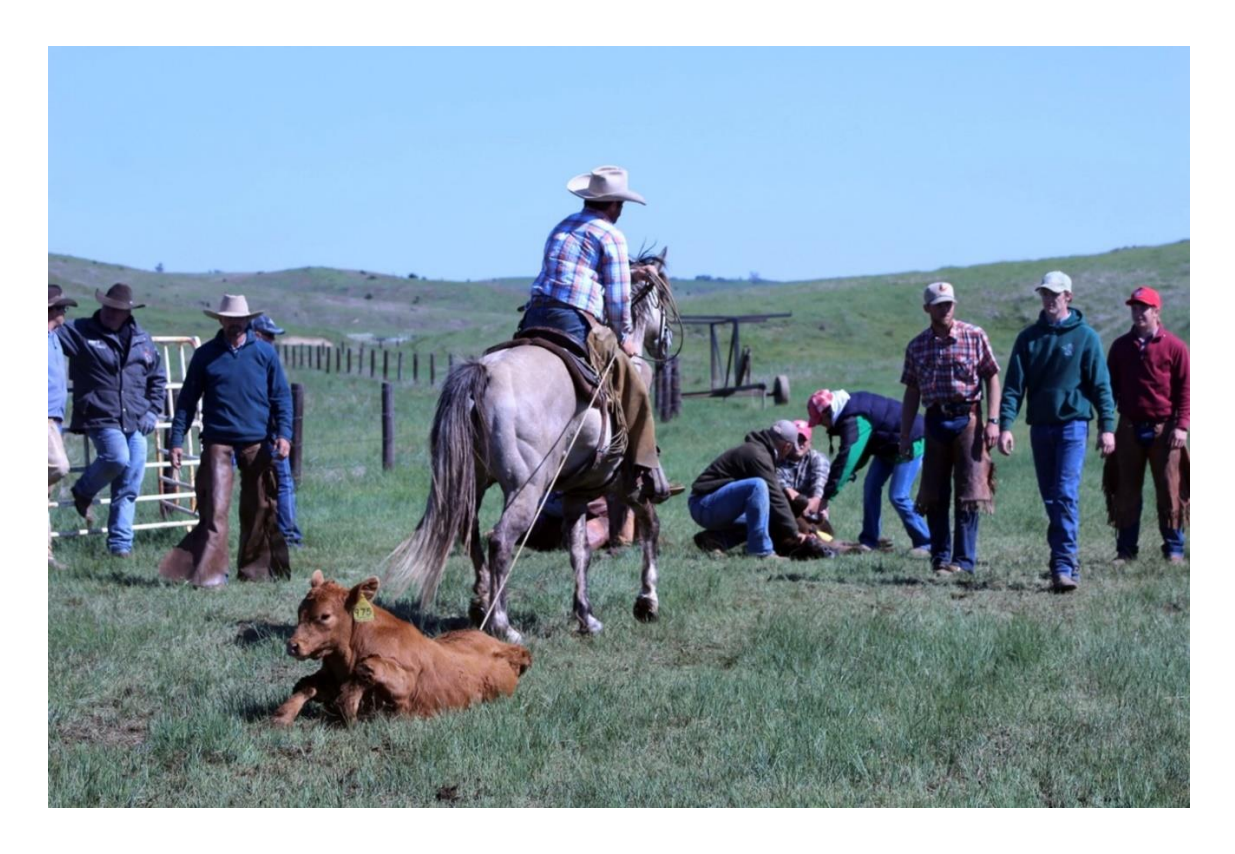
A cowboy ropes and drags a calf to the branding crew.